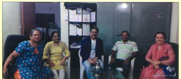
We, the trustees of the Make My Dream Foundation, meet at the regular interval to review the activities and future plans of the trust.

A renowned architect with over 39 years of experience, he has completed a wide array of large scale architecture projects across multiple cities in India and abroad. He has joined advisory panel of the Foundation in 2024. His guidance and support is playing valuable and active roll in upcoming projects; like "Gurukul" of the Foundation.