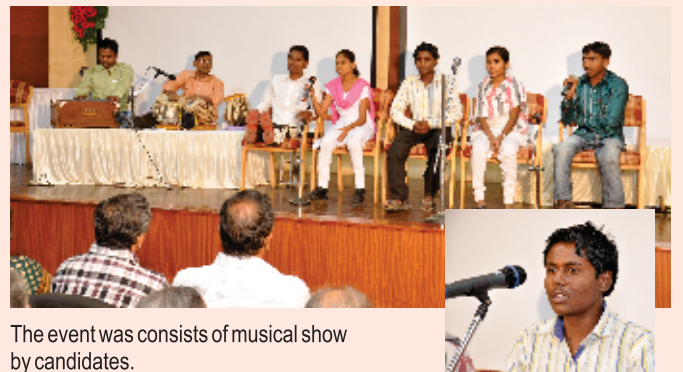
The event was consists of musical show by candidates.

donors for lifetime. Responsible Parent has also been felicitated with trophy to encourage responsibility amongst parents.